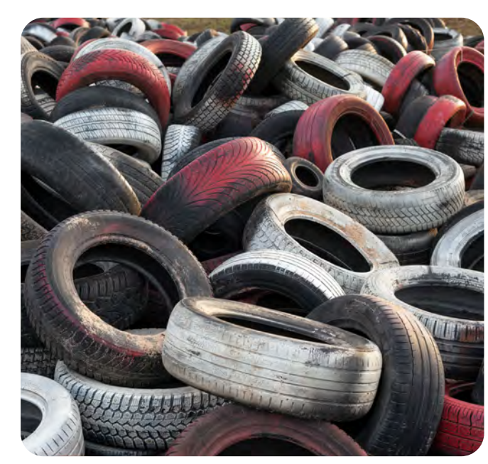
Figure 9 - Variety of red white and black waste car tires waste.

lizing tyres with the longest life minimizes the need for disposal. Alternatively, they may be recycled to various uses, either whole or as shredded material. Whole, or preferably shredded, tyres can be landfilled. However, whole tyres and similar articles like uncrushed bottles may tend to float to the surface of a dump. Collection of tyres in above-ground dumps constitutes an eyesore and a hazard for insect control and potential for uncontrolled combustion.