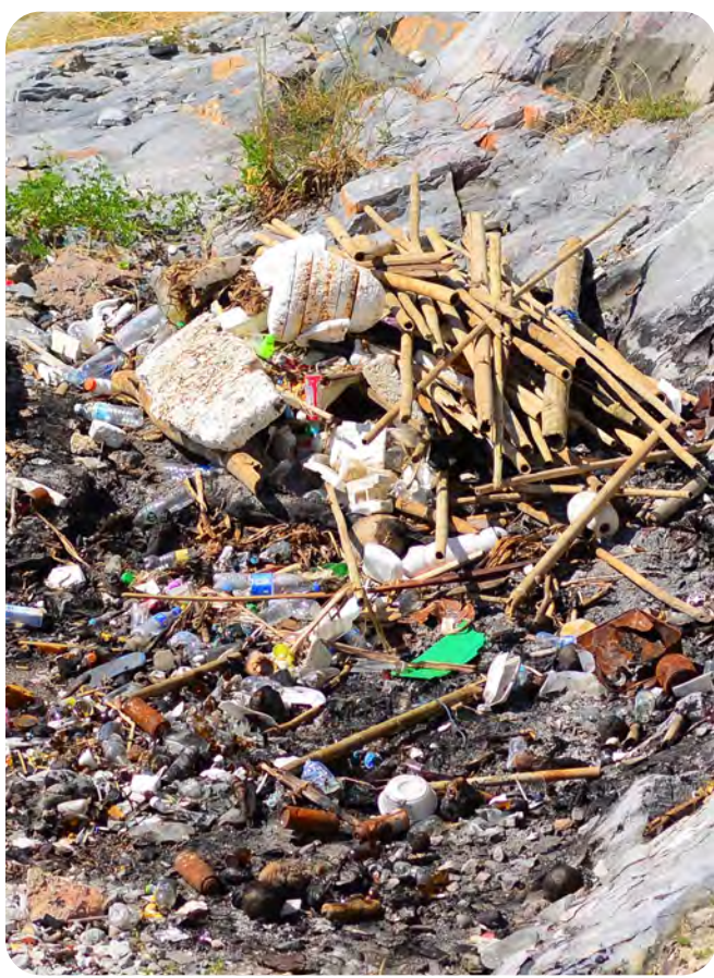
Figure 2 - Compost.