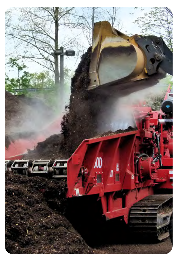
Figure 7 - Compost Grinder.

Parties to the Basel Convention on the Control of Transboundary Movements of Hazardous Wastes and their Disposal have the overall obligation to ensure that transboundary movements of hazardous and other wastes are minimized and that any transboundary movements are conducted in a manner which will protect human health and the environment.