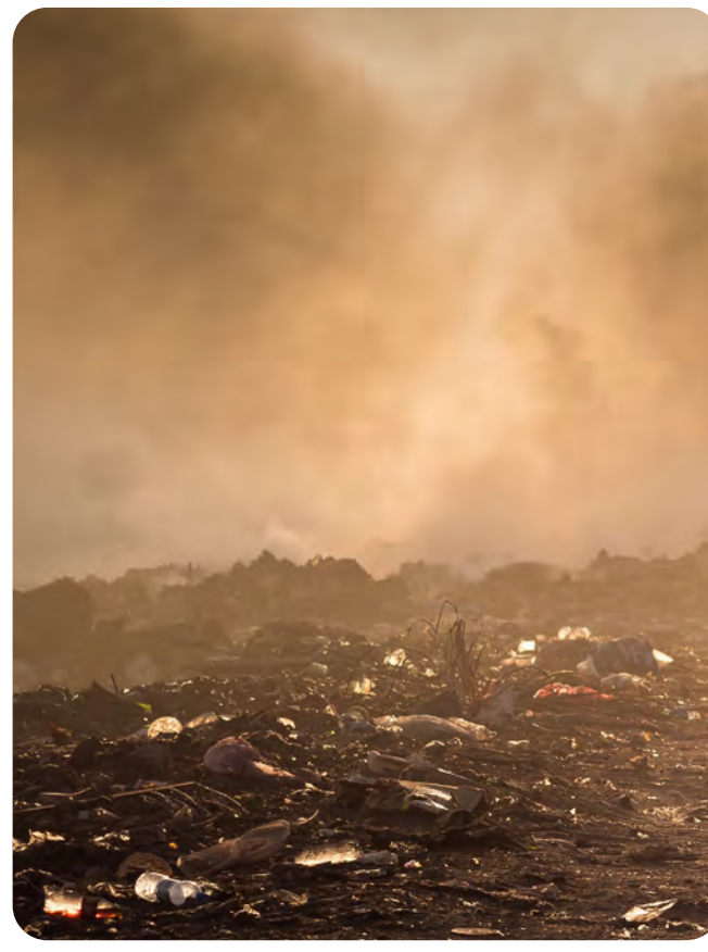
Figure 1 - Man picking waste from open burning dump site.

In this part of the guidance, a number of specific types of open burning are considered in generic categories, typically because means of reducing emissions of persistent organic pollutants in each category are similar (Lemieux, Lutes and Santoianni 2004). Accidental fires and intentional combustion of non-waste materials are not considered; however, they may also be sources of persistent organic pollutants. Parties to the Convention are urged to take steps to reduce accidental biomass burning of all types as well as accidental fires in residences, automobiles and places of business. Parties may wish to consider restrictions on fireworks or other recreational open combustion.