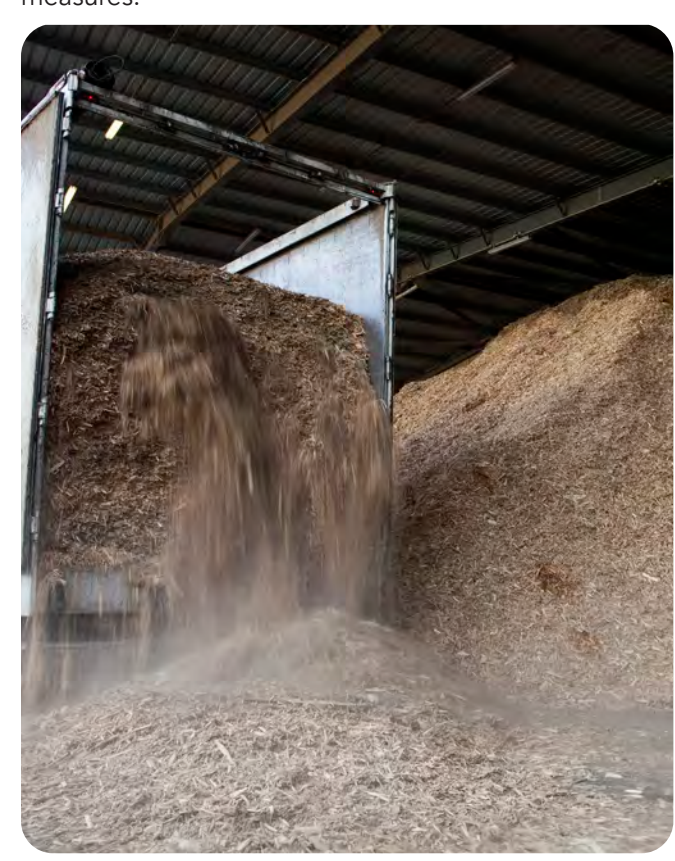
Figure 4- Stored organic waste being poured from a lorry into a large warehouse for biomass fuel production.

Application of chemicals in agriculture and forestry should be minimized consistent with local needs and good management. Where mechanical clearing and alternative use of harvested material is possible, incidental burns can be avoided; however, in certain local situations prescribed small burns may have a place in an overall land management scheme if used to prevent more devastating inadvertent burning with concomitant larger emissions of persistent organic pollutants. Recognizing that control of prescribed burns can be lost, fire abatement procedures (training, equipment, planning), infrastructure (access, roads) and management planning are all reasonable secondary support measures.