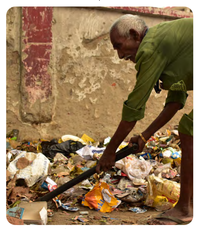
Figure 3 - Waste picker.

Fires control teams can be organized at dumpsites enabling rapid extinguishing of spontaneous fires; see Annex 2 for details on dumpsite fires.